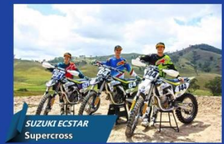
SUZUKI ECSTAR Supercross