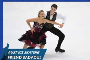
AUST ICE SKATING FRIEND BADAOUTI