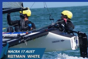
NACRA 17 AUST REITMAN WHITE